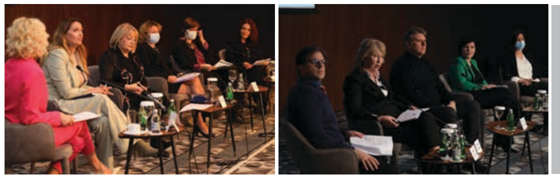
Project Equal - National Conference -

•Involving stakeholders from local self-governments in finding a solution for this problem.