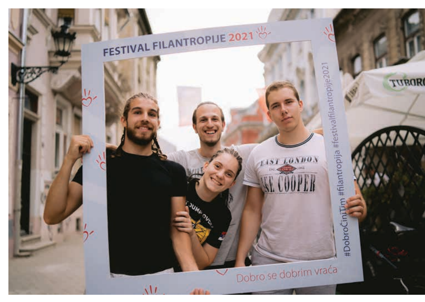
Street Stories, Novi Sad