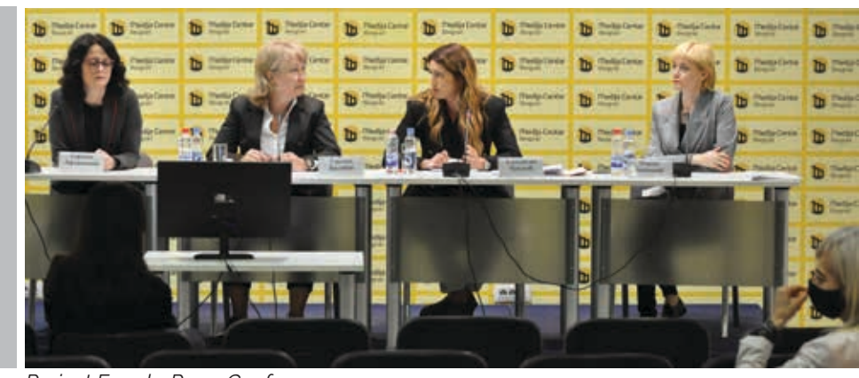
Project Equal - Press Conference

Read more about the project on www.jednaki.com