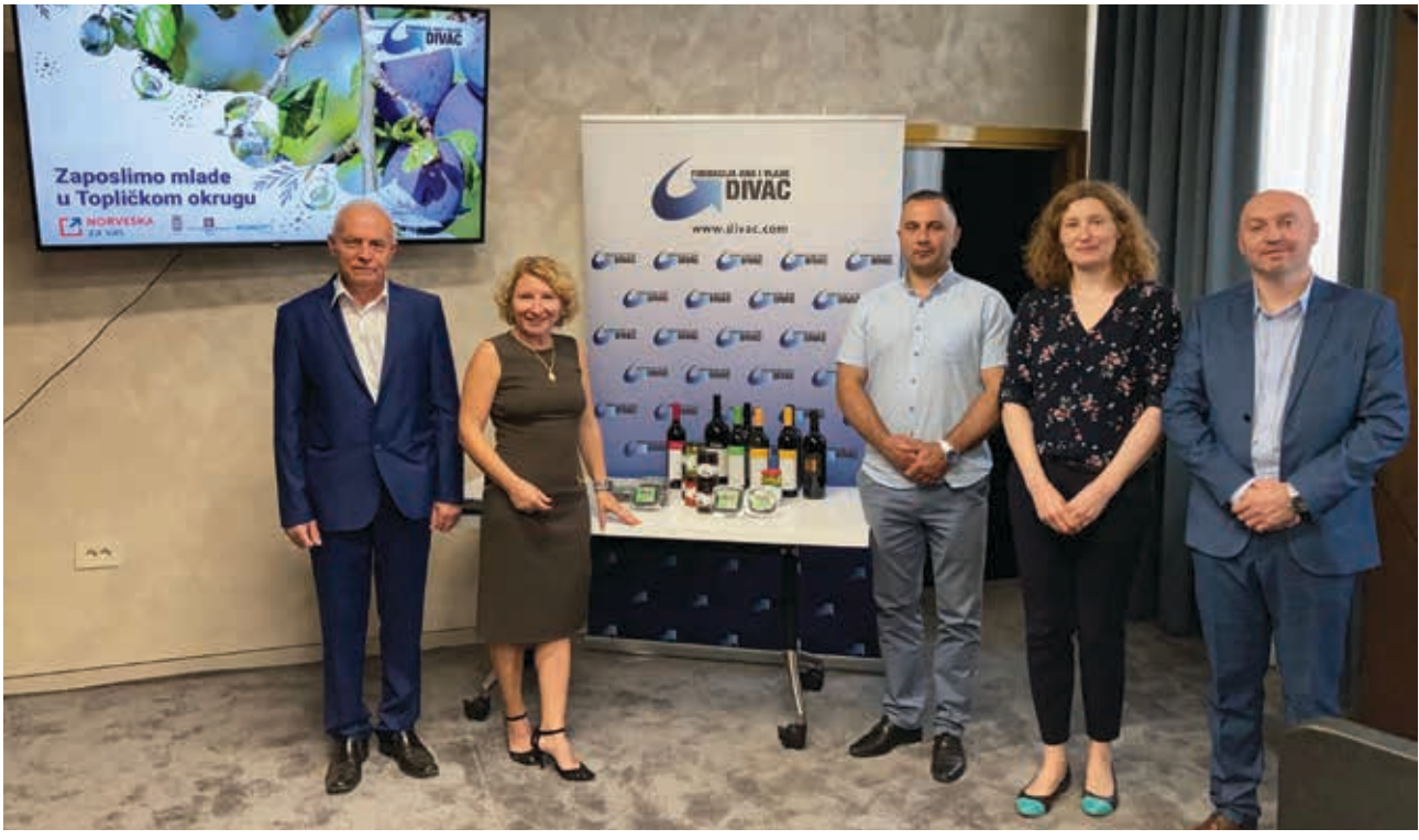
Visit to the Toplica district