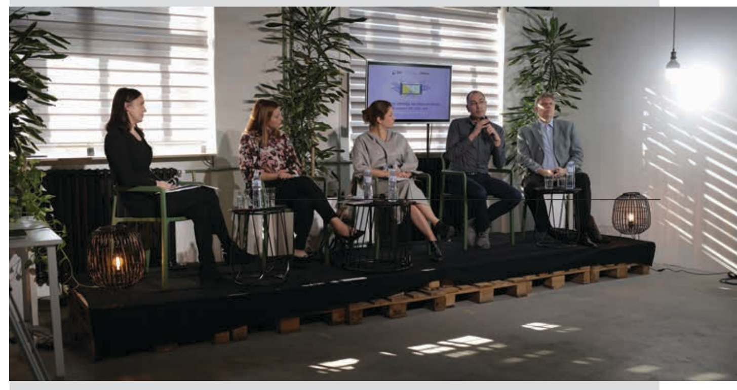
Panel Mental health in the workplace -