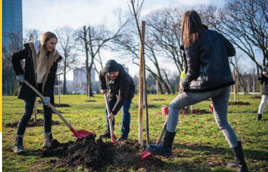
Divac Foundation in afforestation activity