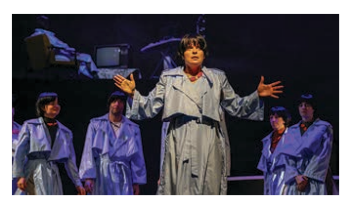
The play Trenutak pre zasićenja

As a consequence of the closure imposed by the COVID-19 pandemic, the culture sector as well as cultural workers have been much affected in previous months, so we supported the