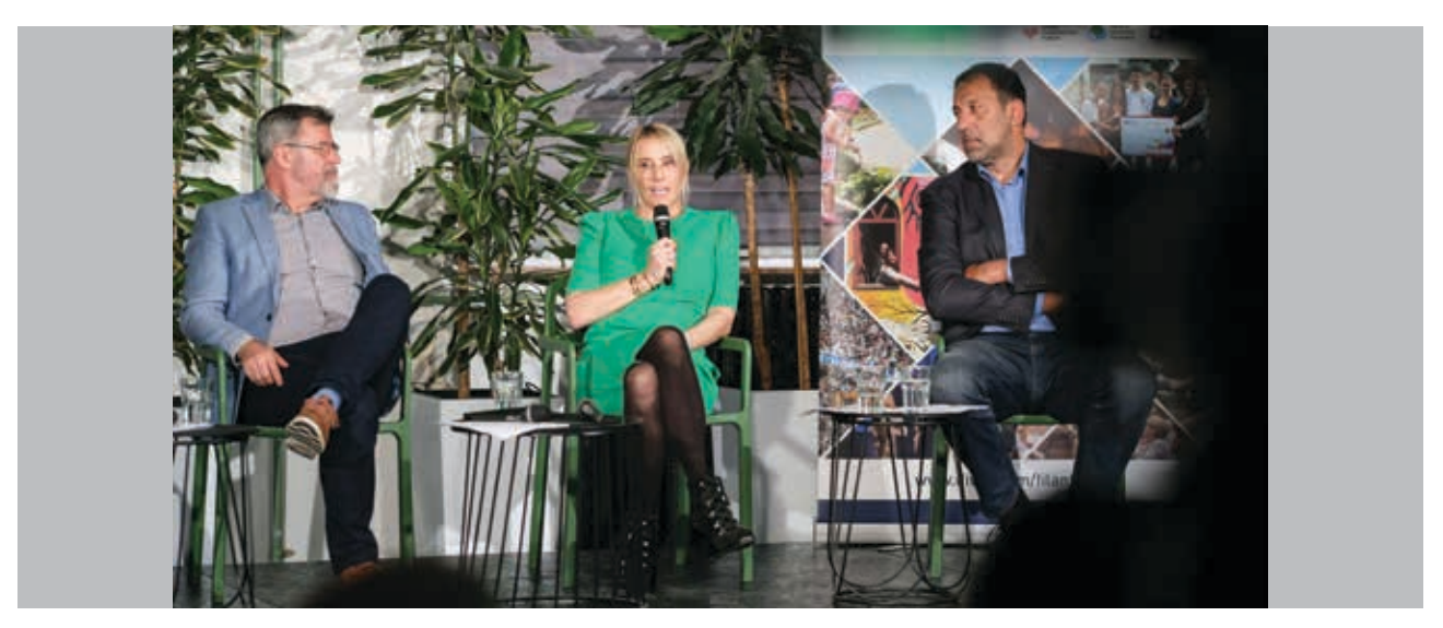
Panel on the cooperation with diaspora