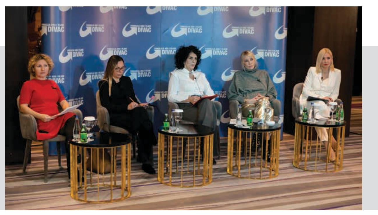
Final conference of the project Solidarity first and foremost -

Bearing in mind the continuation of the crisis caused by the COVID-19 pandemic and the uncertain situation in which a large part of entrepreneurs in Serbia found themselves, the Ana and Vlade Divac Foundation provided free training and knowledge support to 10 businesses so that they could go through the digitalization.