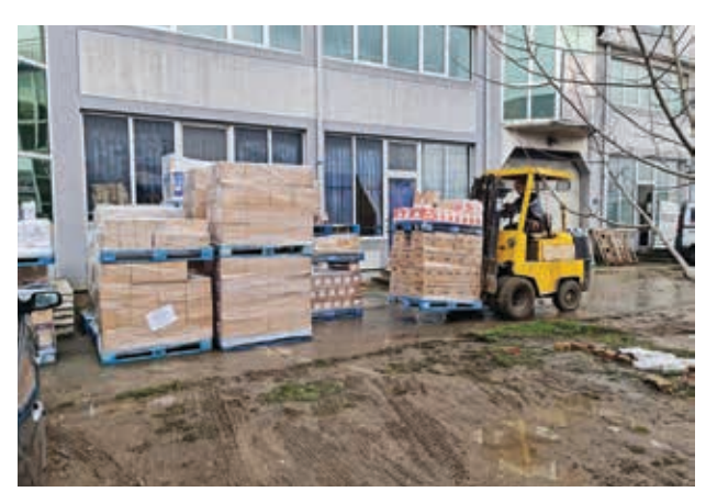
Donations to the Church Soup Kitchen in Belgrade

Thanks to our long-term cooperation with P&G, more than 6,000 health and hygiene products arrived to the Church Soup Kitchen and to the national association of parents of children with cancer Nurdor Srbija. This is the beginning of an activity within which we will distribute products to associations throughout Serbia in 2022 with the aim of supporting the most vulnerable categories of the population and providing them with products for personal hygiene and funds for their operational costs.