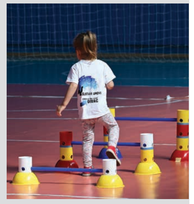
Inclusive workshop of the Defectology office BLISTAVI UMOVI

Also, through the competition, we supported the media in order for them to overcome the crisis caused by the pandemic, so the daily newspaper Danas received funds for the project Show solidarity today (Budi Danas Solidaran), thanks to which we were able to hear 10 stories about doctors working with covid patients in the red zone.